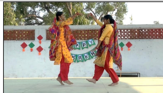
BAISAKHI BY IX-C