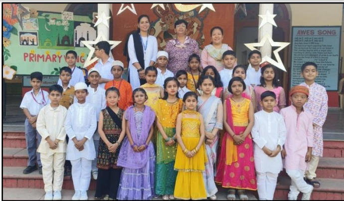
EID UL FITR BY IV A & IX- B