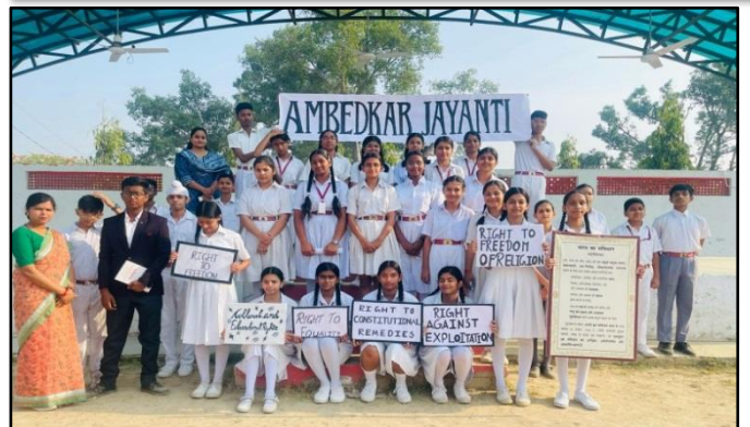
AMBEDKAR JAYANTI BY IX-D