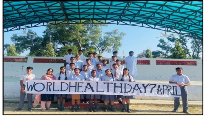
WORLD HEALTH DAY BY IX A