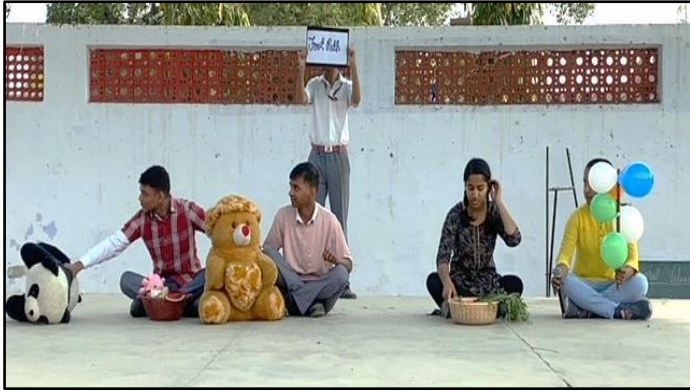
SHARING/KINDNESS BY CLASS XII E