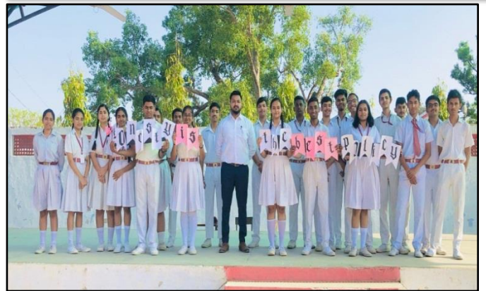
HONESTY BY XII - B