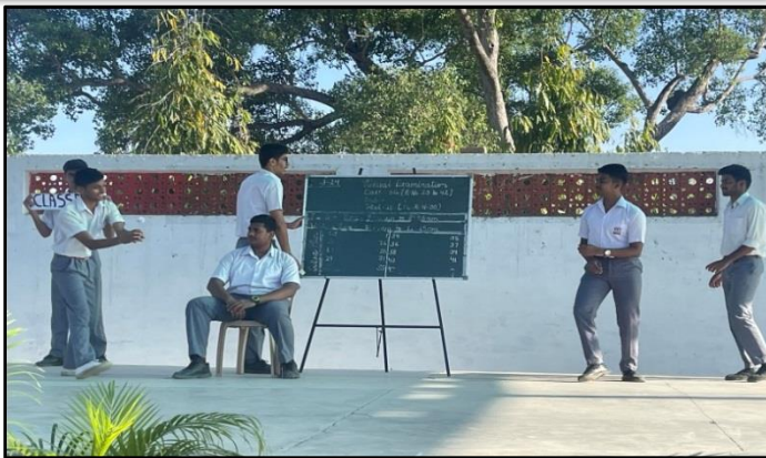
RESPECT BY XII-A