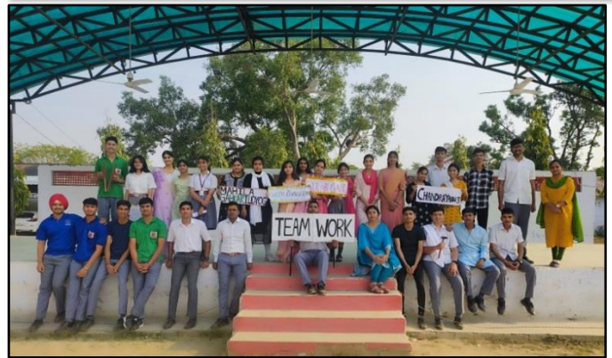
EMPATHY/SELF CONTROL BY XII-F