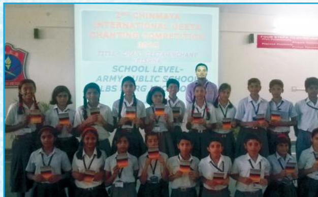
'Geeta Chanting' Competition

Set your goals high and don't stop till you get there.