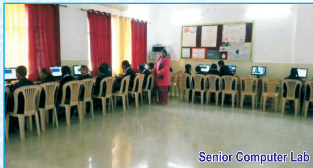
Senior Computer Lab