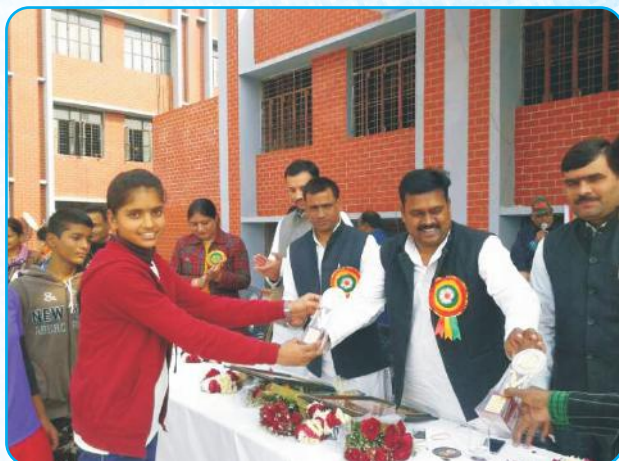
'Best Runners' selected for the State Kho Kho Team