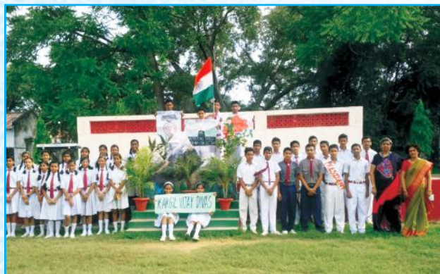
Kargil Vijay Diwas