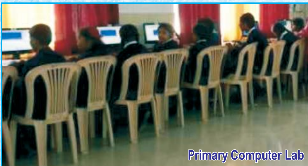
Primary Computer Lab