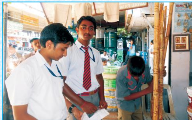
Drive Against Child Labour