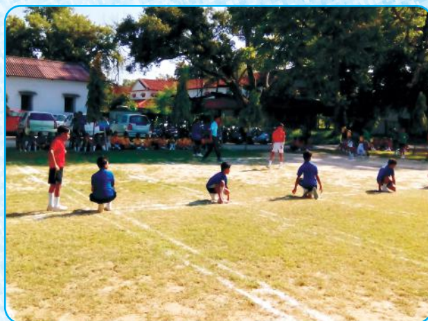
Agile Players of Primary Kho Kho Team