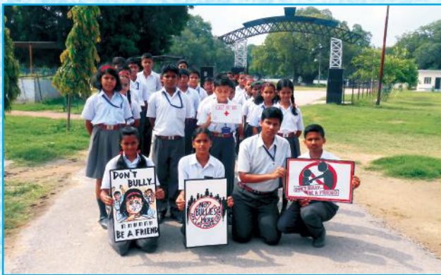
Drive Against Bullying