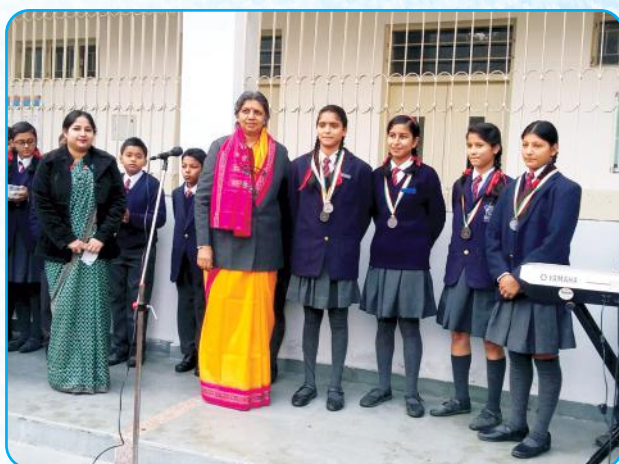
Winners of Inter School Relay Race