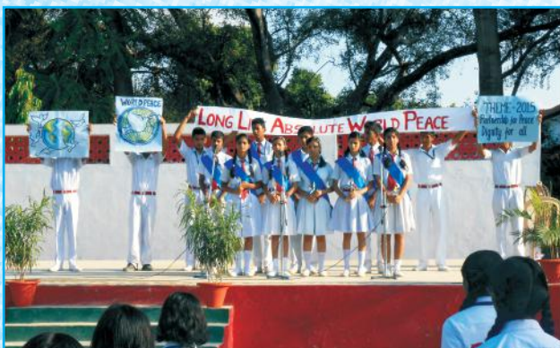
Message of World Peace