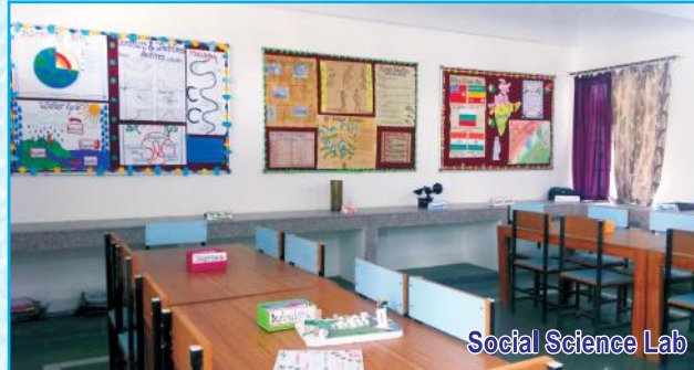
Social Science Lab