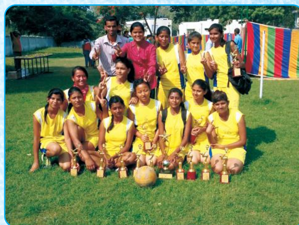
Winners of Volley Ball (Inter APS Cluster)

Excellence is the gradual result of always striving to do better.