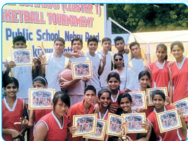
Basket Ball Team