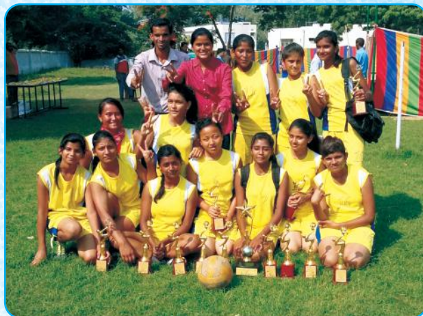
Winners of Volley Ball Team