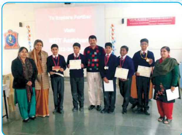
Winners of 'Robotics' Competition