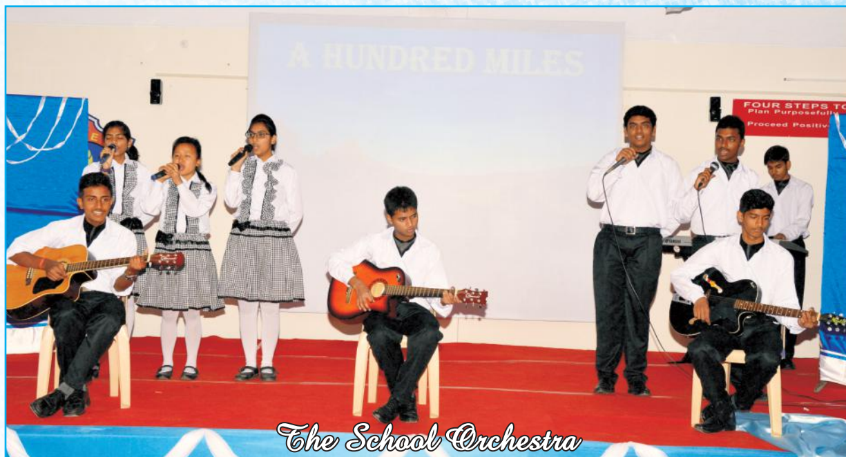
The School Orchestra