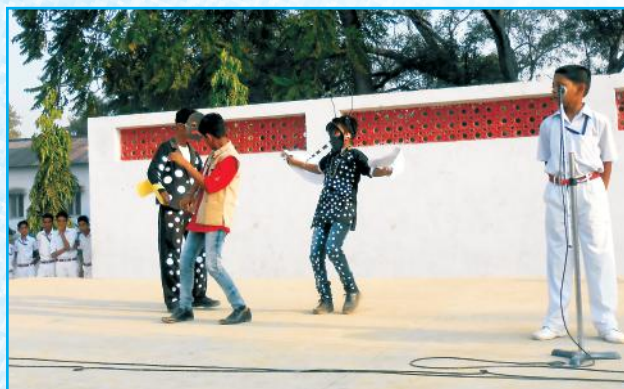
Awareness of Dengue Prevention