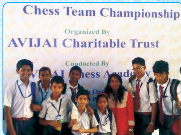
Winners of Chess Championship