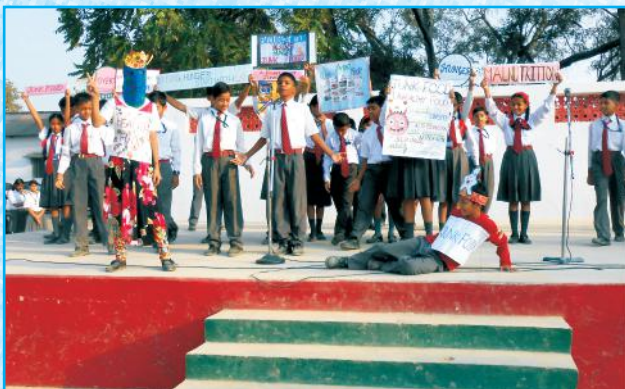
'Say No to Junk Food'