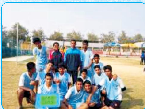
Senior Kho Kho Team